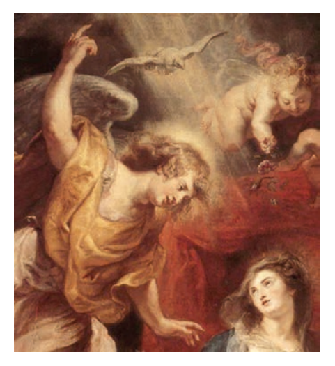
The Holy Spirit as a dove in the Annunciation by Rubens, 1628