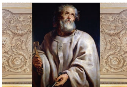
'Saint Peter the Apostle' by Paul Rubens