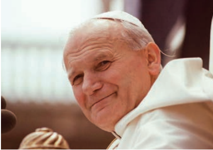
Pope John Paul II

Unity in diversity ... being one in Christ through Baptism!