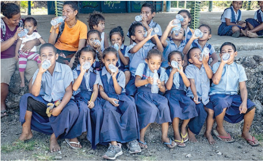
Primary school students in Samoa drinking clean water from their new water tank.